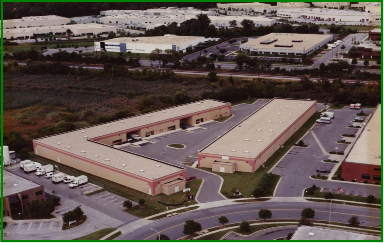
6545 Mid-Cities Avenue, Beltsville, MD 20705